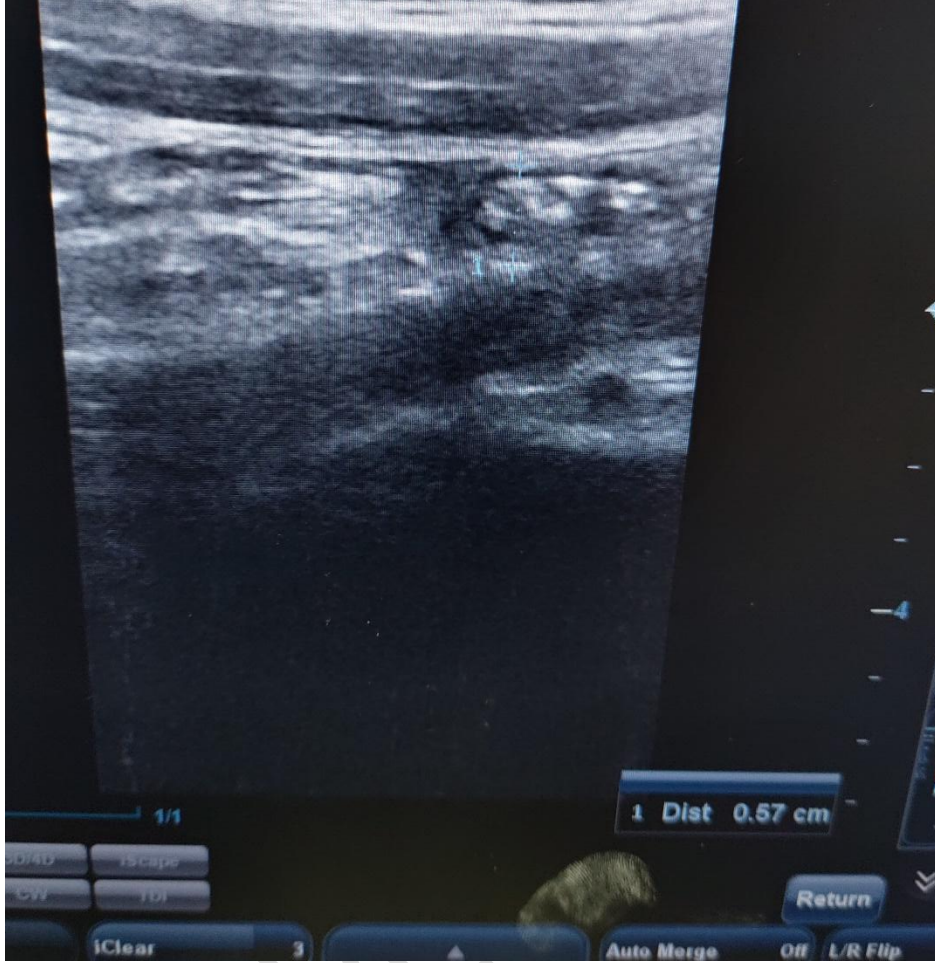
Fig 2: abdominal ultrasound scan revealing inflamed appendix