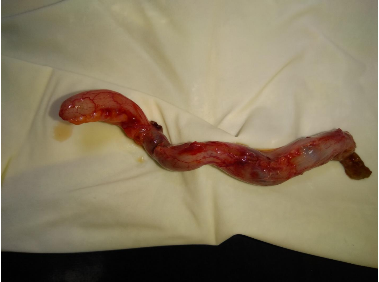
Fig 3: Resected Appendix Specimen