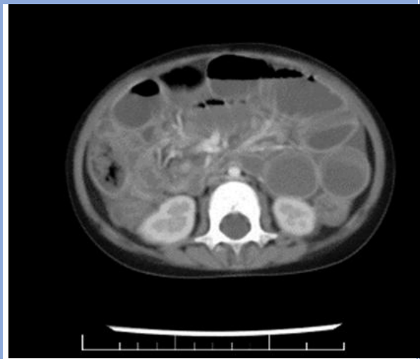
Figure.2 A CT scan abdomen and pelvis image, showing multiple dilated small bowel loops.