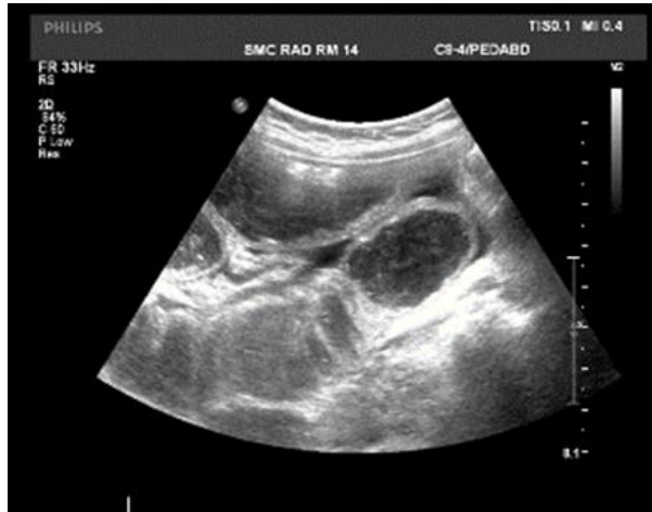
Figure.1 Ultrasound of the abdomen and pelvis, showing dilated bowel loops.