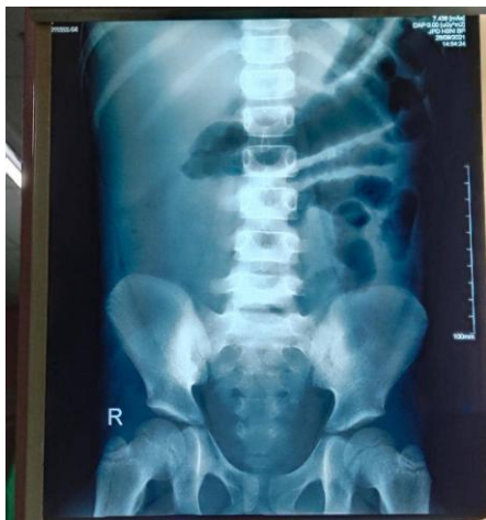
Figure 1: Abdominal X-ray of the patient showing ground glass appearance over the right side suggestive of fluid filled peritoneal cavity