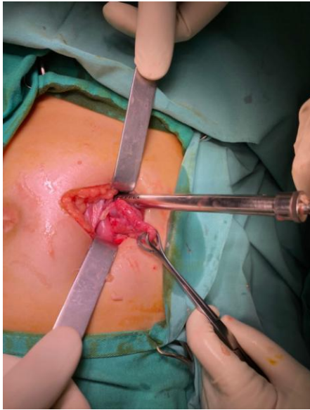
Figure 2: Intra operative finding of the appendix which was normal with slight serosa inflammation, normal in texture and not thickened to suggest that it is not the primary pathology intraoperatively.