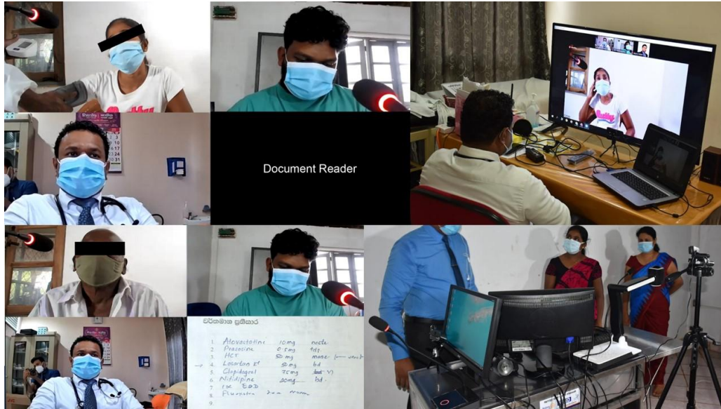
Figure 3: Photographs of videoconferencing at phase 3 connecting periphery with the specialist at the central institute