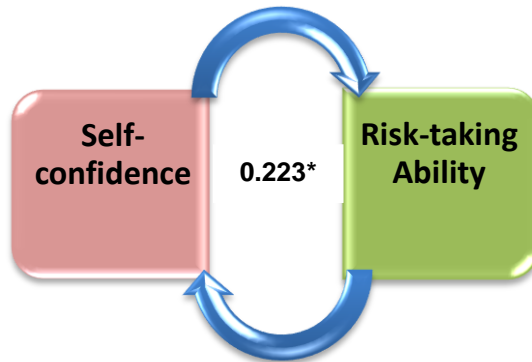
Fig. 3. Positive Significant relation between Self-confidence and Risk-taking Ability of the respondents