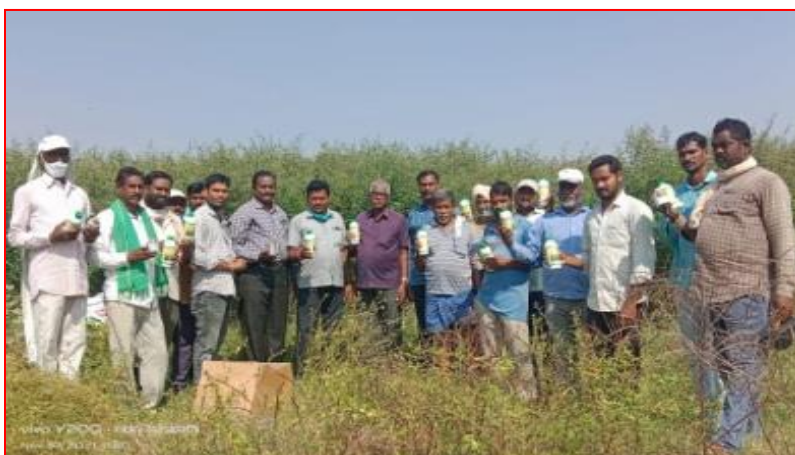
Fig. 1. Distribution of critical inputs (neem oil) to the farmers