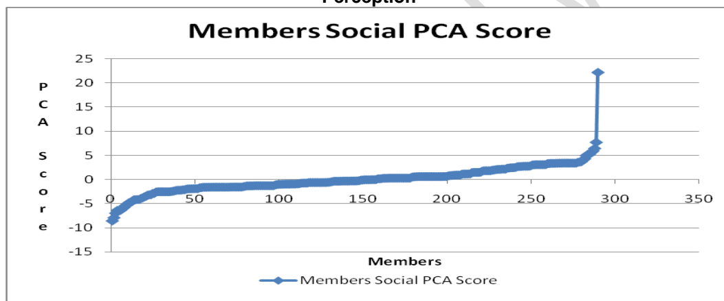
Figure 2: Graphical Representation of Distribution of Members According to PCA Scores on Social Perception

The factor scores of 290 members respondent (Table 6) ranges between 22.22 to -8.58 with Zero (0) mean and 2.78 Standard Deviation (SD). The graphical distribution of factors scores is presented in Fig. 2.