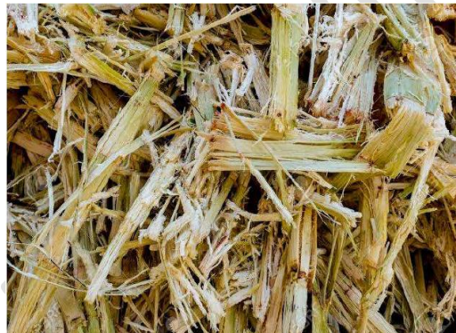
(b) Sugarcane bagasse