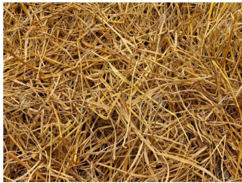
(a) Paddy straw

In order to study the effect of different substrates on the growth and yield of C. indica , an experiment was carried out with three different substrates viz., paddy straw, sugarcane bagasse and coco peat. These selected paddy straw and sugarcane bagasse chopped into 3-5 cm pieces by using grass cutter.