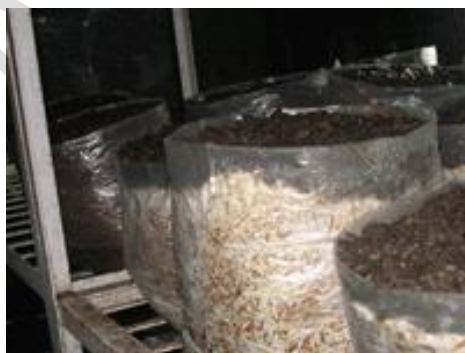
Fig. 2 Casing with black soil and farmyard manure

2.6 Casing: Casing means covering the top surface of bags after spawn run is over with pasteurized casing material in thickness of about 3-4 cm. Casing provides physical support, moisture and allows gases to escape from the substrate. Milky mushroom needs casing for fruit body initiation. After completion of spawn run or mycelial growth in the beds, bags were cut into two halves, opened and casing layer spread on the surface of mushroom bed at three different thickness of 15, 30 and 45 mm and sprinkled with water whenever it is necessary. These casing materials were prepared by sterilized black soil and farm yard manure. The physical characteristics of the casing material like water holding capacity (%), bulk density (g/cm 3 ), pH, EC (dS/m) and the texture of different casing materials were studied.