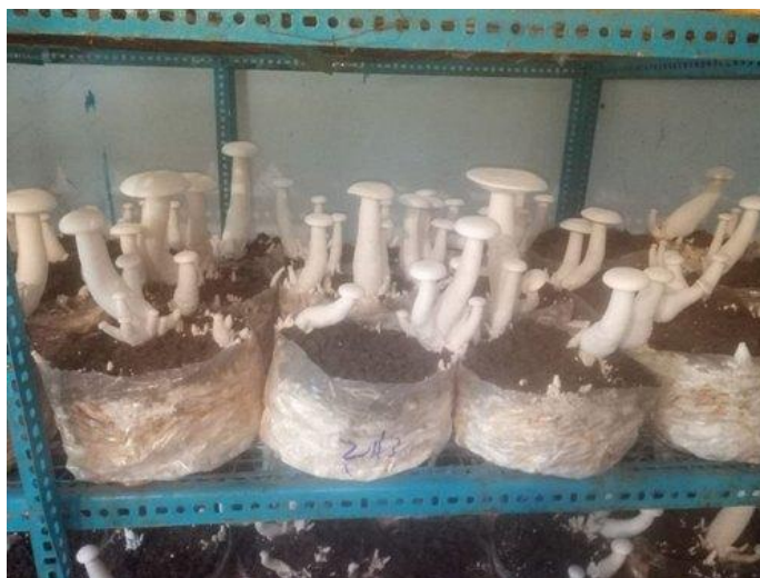
Fig. 4 Yield of milky mushroom