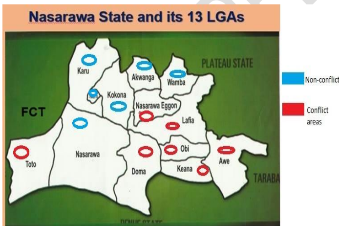
Fig 2: Map of Nasarawa State showing study areas