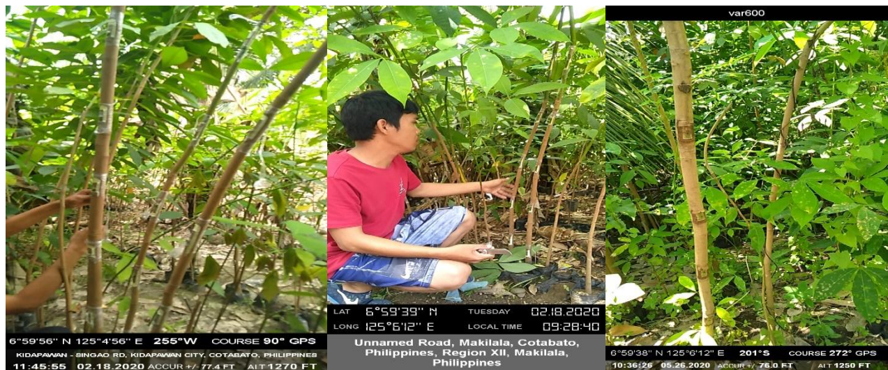
Figure 2. Multi-layer buds

Mean with the same letter subscript are insignificantly different at 5% using LSD