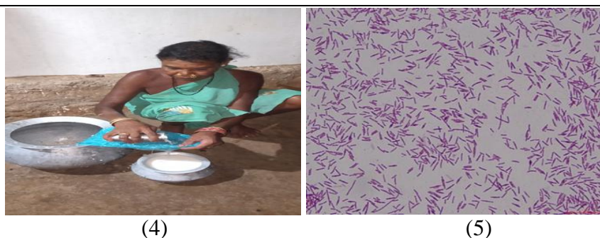
Figure: (1) Baddi (2) Rumna (3) Prepared beverage ready for filtering (4) Pendam (5) Gram's staining photograph of Pendam

Amino acids are considered to be protein synthesizers. Following are the qualitative test conducted for amino acids: (a) Ninhydrin- Positive with purple colour, (b) Millon- Positive with Reddish brown, (c) Xanthoproteic- Positive. Initially yellow colour but changed orange, (d) Sakaguchi- Positive with red colour, (e) Sulphide- Negative result. Amino acids found in Pendam provide a better picture for concerned beverage. Tyrosine and Phenylalanine are precursor to each other. Tyrosine is an aromatic amino acid may help in treat depression, anxiety, lower body fat and plays an important role in production of thyroxin (Jongkees et al., 2015). Though Phenylalanine is not recommended for people with phenylketonuria due to neurological disorders, it can be productive as a pain reliever in many cases (Ueda et al., 2017). Tryptophan is considered as an anti-depressant as well as a human metabolite. It helps in mitigating several diseases like diabetes and kidney issues. Arginine is supportive to combat fatigue, stimulate the immune system and for treating heart diseases (Bahadoran et al., 2016).