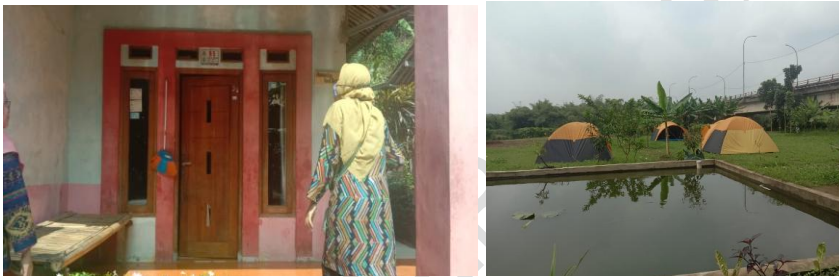
Fig. 3. Homestay and Camping Ground

Ecotourism in Keranggan has several tourism programs as can be seen in Figure 3.