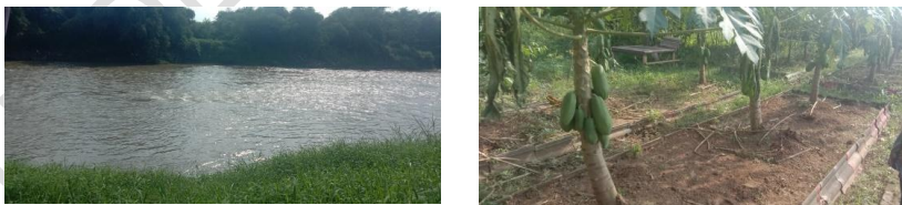
Fig. 2. Cisadane River and Pick Tour

From the results of observation and documentation techniques carried out by researchers, the attractiveness of Green Tourism in the Ecotourism area of Keranggan Village can be seen in Figure 2.