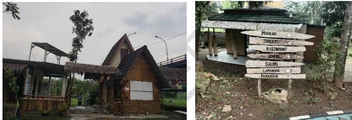
Fig. 5. Tourism Information Center (TIC) and Signboard

The physical and non-physical carrying capacity in the village of Keranggan can be seen in Figure 5.