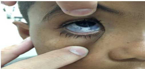
Figure 1 Eye movement without affecting the eyelids

Biomicroscopy showed lesions with bluish episcleral pigmentation in the right eye (RE) characterized by maintaining its position according to eye movement without affecting the eyelids and their annexes (Figures 1 and 2). In addition, he had heterochromia and iris nipples in the RE (Figure 3).