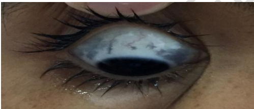
Figure 2 Eye movement without affecting the annexes