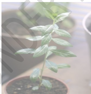
(a. Source; Sarita et al. , 2020) 19

Lawsonia inermis: Henna Lawsonia inermis , belongs to Lythraceae also known as the loosestrife family. Henna is cultivated by many farmers for cosmetic and pharmaceutical purposes, it belongs to the group of plants that are popular in nature and all parts of the plant (root, stem, leaf, flower pod and seed) are of great medicinal importance have been cultivated for traditional medicine because of its cosmetic agent and pharmacological activities worldwide (15) . Most importantly, the leaf part of the plant contained a coloring compound called Lawson which is a red orange dye molecule, also known as hennotannic acid used for dyeing the skin, hair and fingernails as well as fabrics including silk, wool and leather (16) . Apart from the dyeing properties, the L. inermis , normally known as hina, or the henna tree in English, Mehendi in Hindi, Shudi in Bengali, Goranta in Kannada, Mailanschi in Malayalam, Padchi-methi in Marathi, Dvivraita in Sanskrit, Gorata in Telugu, Aiyanam in Tamil, Monjathi in Oriya, Maduyanta in Tibetan, the mignonette tree, and the Egyptian privet have been reported to have analgesic, hypoglycemic, hepato-protective, immune-stimulant, anti-inflammatory, antibacterial/fungal, antiviral and antiparasitic properties for the cure of renal lithiasis, jaundice, wound healing and prevention of skin inflammation and leprosy. The species is named after the Scottish physician Isaac Lawson, a good friend of Linnaeus (7, 17) .