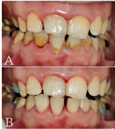
Figure 1 Intra oral picture of a thalassemia patient showing Pre (A) and post (B) scaling appearance. The blue arrows point at the characteristic yellow discoloration of the teeth

Neutrophils represent the principal leukocyte (>95%), which are recruited as the first line defence against the bacterial biofilm [20]. Their absence leads to periodontal tissue damage, whereas the excess also causes periodontal destruction. Hence, both the quantity as well as the distribution of the neutrophils is necessary for periodontal health [14]. In diseases with neutrophil dysfunctions, periodontal tissue is lost very rapidly [21]. TM- \beta patients exhibit defective neutrophils and macrophages with compromised ability of phagocytosis [22]. When there is supplementary gingival inflammation, that may in turn, alter the clinical signs of both the chronic diseases [23]. This suggests that patients with TM- \beta and gingival inflammation have two chronic inflammatory conditions, each of which may affect the other.