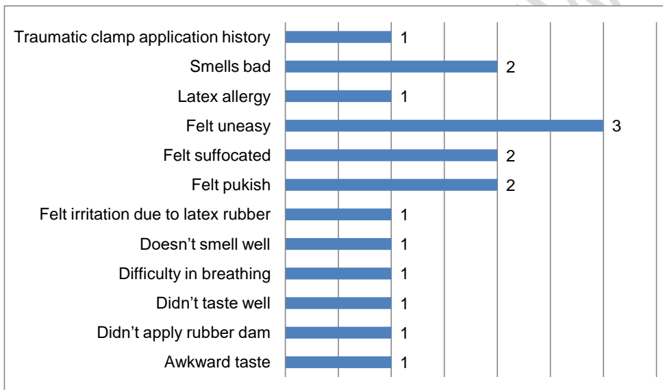
Figure III: Reasons of rejection(as per patient's response)