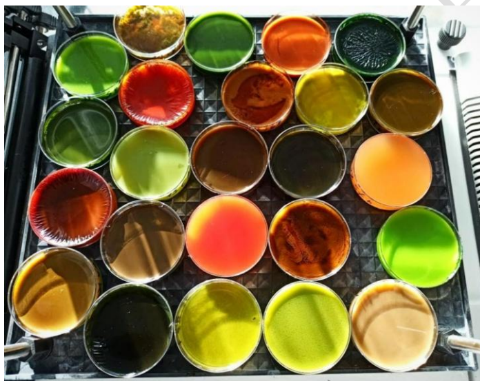
Figure 1. Drying process of aqueous plant extracts using open petri dishes in an incubator shaker at 40°C.

After de drying process, each crude extract was dissolved in the required volume of Dimethyl sulfoxide 5%, v/v (DMSO, BDH Laboratories, VWR International Ltd., USA) to achieve a concentration of 128 mg/ml. The extracts were further sterilized by microfiltration (0.22 µm) and the solution obtained was used in the microdilution process and to prepare the solution used for the well diffusion method (50mg/ml).