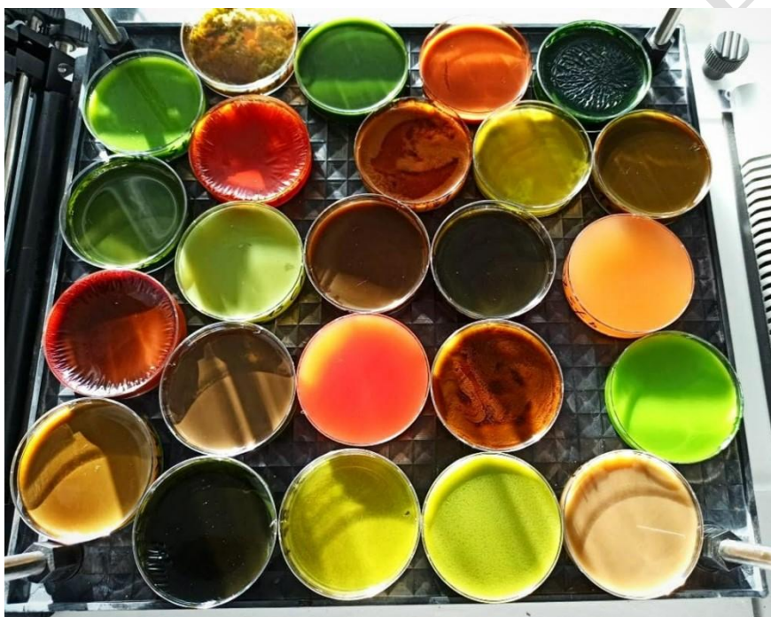
Figure 1. Drying process of aqueous plant extracts using open petri dishes in an incubator shaker at 40°C.

After de drying process, each crude extract was dissolved in the required volume of Dimethyl sulfoxide 5%, v/v (DMSO, BDH Laboratories, VWR International Ltd., USA) to achieve a concentration of 128 mg/ml. The extracts were further sterilized by microfiltration (0.22 µm) and the solution obtained was used in the microdilution process and to prepare the solution used for the well diffusion method (50mg/ml).