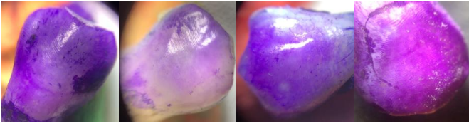
Fig3 picture represents Amelogyphics patterns of labial surface of maxillary premolars staining of tooth using hematoxylin(3c,3d) and toluidine blue(3a,3b) by soak method and studied under stereo microscope