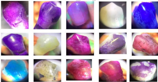
Fig2- picture represents the Amelogyphics patterns on staining the labial surface of maxillary premolars using 15 different stains by soak method and studied under a stereo microscope.