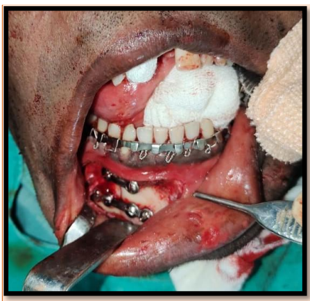
Fig 1 Morphology

suturing technique (fig 1). Upper palatal split was reduced and fixed with 2mm thick three holed plate followed by placement of arch bar and occlusion was gained. Later the knee's approach was used to explore the Le-forte fracture with respect to the right side. Right side ZMC fracture was reduced and fixed with three 2 holed with gap miniplate. (fig 2). Pyriform aperture reduced and fixed with four holed with gap miniplate and closure was done with 3-0 vicryl. The patient was watched, and antibiotics and analgesics were prescribed as postoperative treatment. After a week, the further oral sutures were removed. The patient made a full recovery and had a smooth recovery. For one month, the patient was prescribed a soft diet. To keep the occlusion, postoperative elastics were used after 4 days. With an almost unnoticeable scar, postoperative stability and functioning were good.