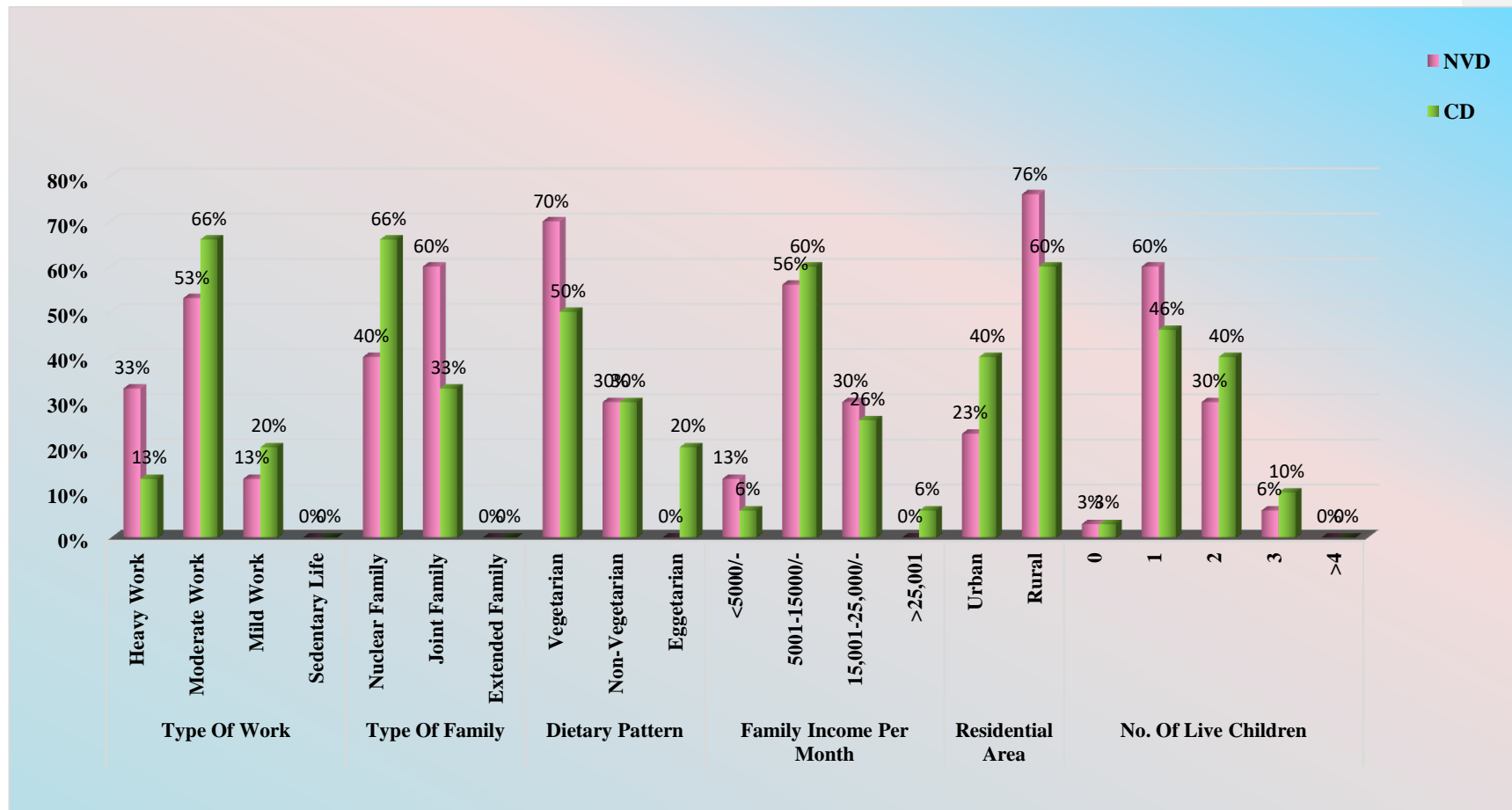
Figure 2: Percentage distribution of samples according to Type of work, Type of family, dietary pattern, Family income per month, Residential area and Number of live children