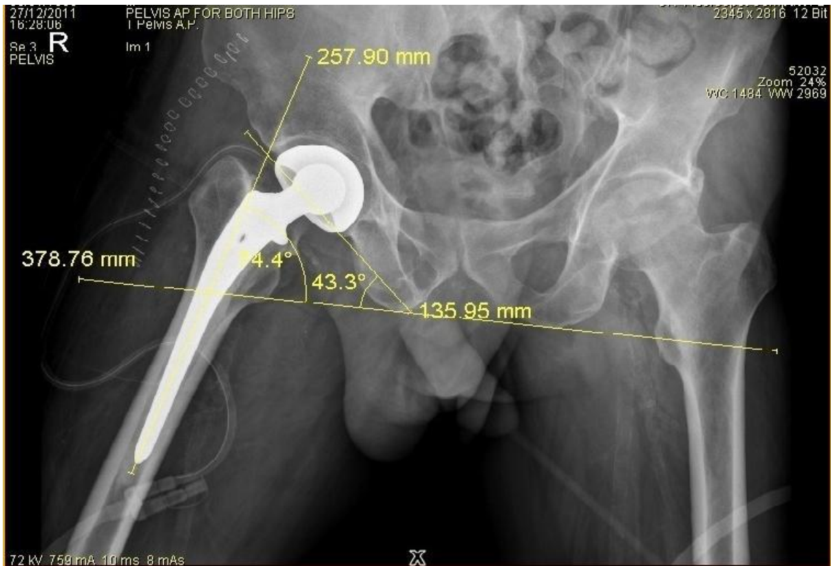
Fig 4. X-ray of pelvis with both hips (Abduction of operated hip) with Bipolar prosthesis on right side

showing Angle A1 – 43.3 and Angle B1 – 74.4 degrees.