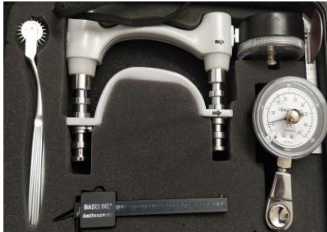
Fig.1: Hand grip Dynamometer