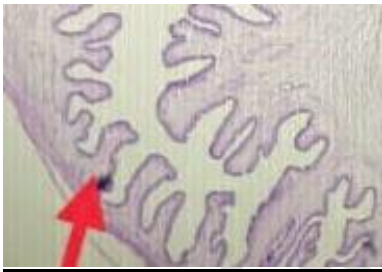
Fig 5 Shows the double layered, Duct like invaginations, eosinophilic membrane seen in high power view.