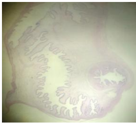
Fig 1: Shows a complete Cysticercus parasite seen on scanner, in histopathology.

Microscopically, it presented as a skeletal muscle along with fibrofatty tissue piece. Adherent Adherent to it was a cystic cavity which was lined by inflammatory cells like macrophages, lymphocytes and plasma cells were seen creating a chronic granulomatous reaction surrounding it. Within the cystic cavity, scolex with hooklets, and suckers of the larvae were seen. These larvae composed of duct like invaginations. Its body wall showed a myxoid matrix. All of these features suggested of granulomatous lesion due to parasitic infestation.