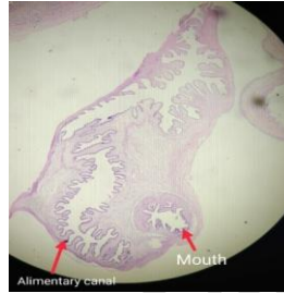
Fig 4: Shows mouth and alimentary canal of the Cysticercus parasite seen on scanner, in histopathology.