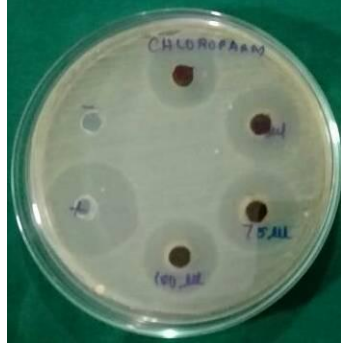
Figure 1: Culture plate is showing efficacy of antibacterial activity of acalyphaindica root extract was tested with four different concentrations which were 25 μg/ml, 50 μg/ml, 75 μg/ml, 100 μg/ml.