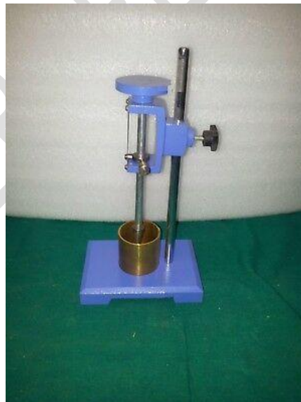
Vicat needle apparatus (Fig. no.2)

Cylindrical metal mould of vicat apparatus (Fig. no.: 2) of dimensions 50 mm height and 35mm internal diameter will be filled with the mixture and smoothed with spatula. Mould is placed in the apparatus in its position. Prior to setting of the gypsum product valve screw will be loosened to allow the needle tip to just touch the surface of the gypsum product. Then needle will be released to penetrate the mix, needle should reach up to the bottom of the mould. This entire process is to be repeated every 30 seconds, each time mould is slightly repositioned and needle is to be cleaned. Every time valved screw is tightened when needle will be penetrate the mix and degree shown in the stylus is to be recorded. This process is repeated until needle cannot penetrate up to the bottom of the mould.