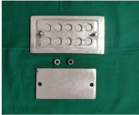
Mold for testing abrasion resistance (Fig. no:1)