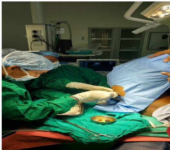
Fig 4. Operative period

be detected using a convex vertical probe. For spinal access, L2- L3 intervertebral space through which dura can be observed was selected. Under the guidance of US, subarachnoid space was entered at the first attempt using a 23 G quinckes spinal needle directed 45°-60- degrees cephalad. After observing outflow of cerebrospinal fluid, 3.4 ml of bupivacaine heavy (5 mg/ml) was injected through the spinal needle slowly.