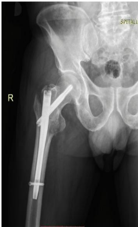
Image 1. X-ray image of hip joint

Pain assessment was done on Visual analog scale and the score was 7/10 . On inspection, patients right leg was affected due to road traffic accident , there was a scar mark present at anterior aspect of the hip joint and range of motion was affected due to pain. There was stiffness present at the hip joint and patient had difficulty in walking and ascending of stairs.