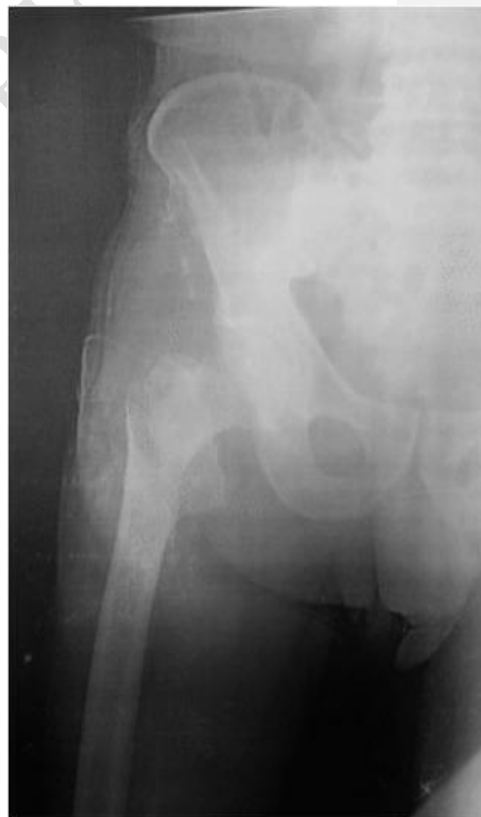
Image 2. Xray image in supine position