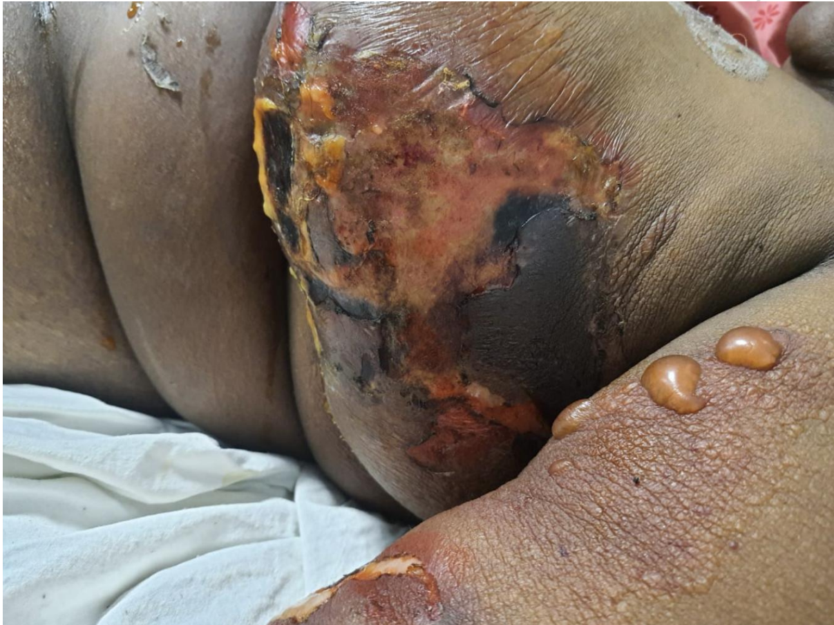
Figure 1: Showing nultiple fluid filled bullae along with granulation tissue and blackening of skin over the left side of chest