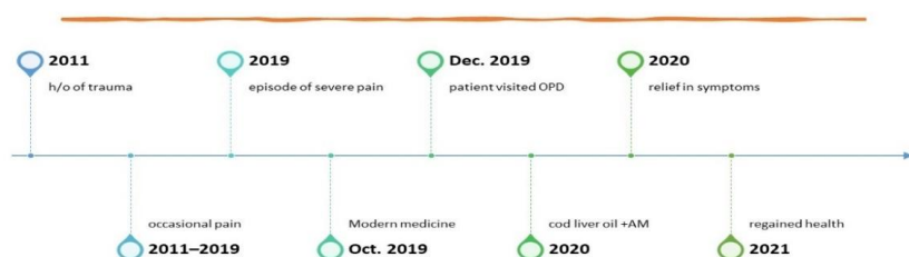
Figure 2 timeline of symptoms

Once cod liver oil was prescribed, the patient had marked relief in the symptoms. After few months he began to visit the workplace. He also started to work in next week and he has good confidence about the treatment. He used to have low back pain sometimes, but as soon as he started cod liver oil capsules, the pain relief was there. He was asked to stop all the medicine and continue cod liver oil only. So, he was on cod liver oil for 7 – 8 months.