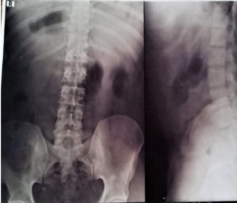
Figure 3 x-ray LS