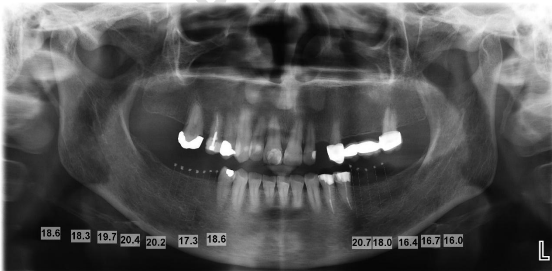
Figure1. Panoramic radiography and measurement of specified points

Stata 14 statistical software was used for data analysis. To describe the data, depending on the distribution of variables, central indices including mean and median and scatter indices including standard deviation and interquartile range are used. To compare the average available bone length for implant placement with two methods of panoramic and CBCT Paired T-test was used ( P\alpha = 0.05 ).