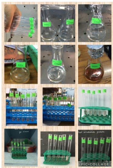
Figure 2: Dpph assay