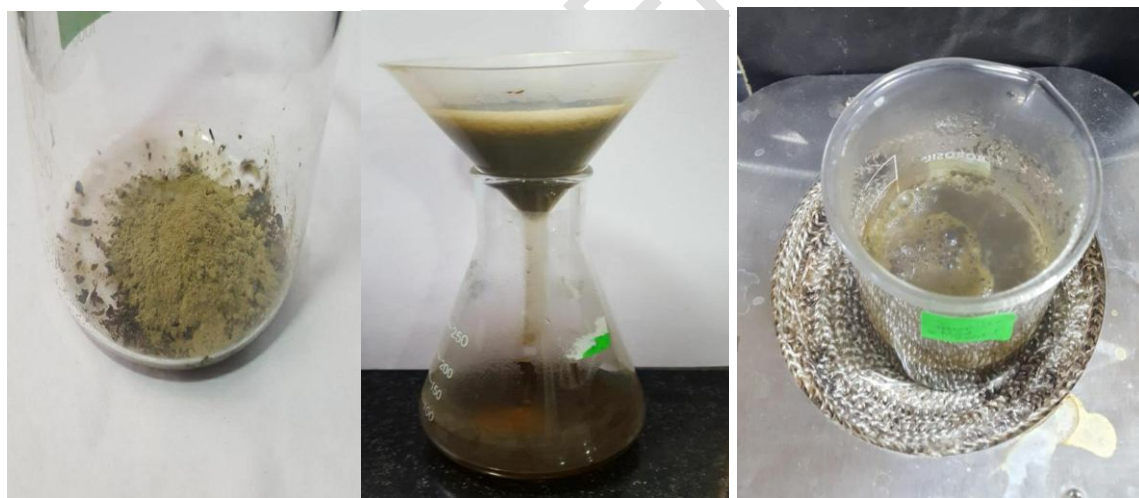
Fig 1 showing the pictures of preparation of mint and green tea formulation.

Green synthesis of mint and green tea formulation :