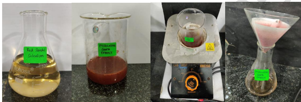
Fig-1 : Synthesis of P.santa Mediated Selenium nanoparticle

The extract preparation was done by taking 0.5g of red sandal selenium mixed with 50ml of distilled water. The extract was boiled for 10mins at 55° Celsius and it had been filtered. Again sodium selenite was mixed in 50ml of distilled water and mixed with filtered pterocarpus santa extract. The red sandal selenium extract was kept in the shaker for an hour and reading was taken for its cytotoxic effect. Note (Mention the source that contains the method of work)