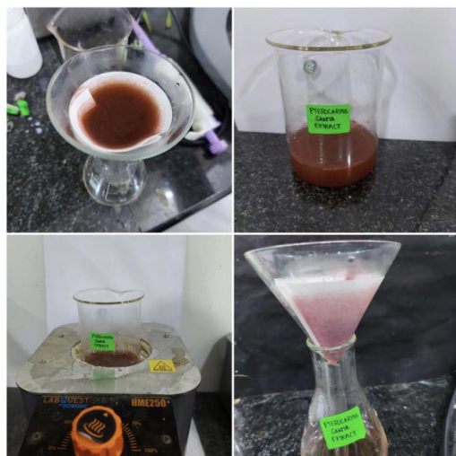
FIGURE 1 - GREEN SYNTHESIS OF SELENIUM NANOPARTICLES AND PTEROCARPUS SANTALINUS BASED MOUTHWASH

Comment [DK12]: It should be written journal format.