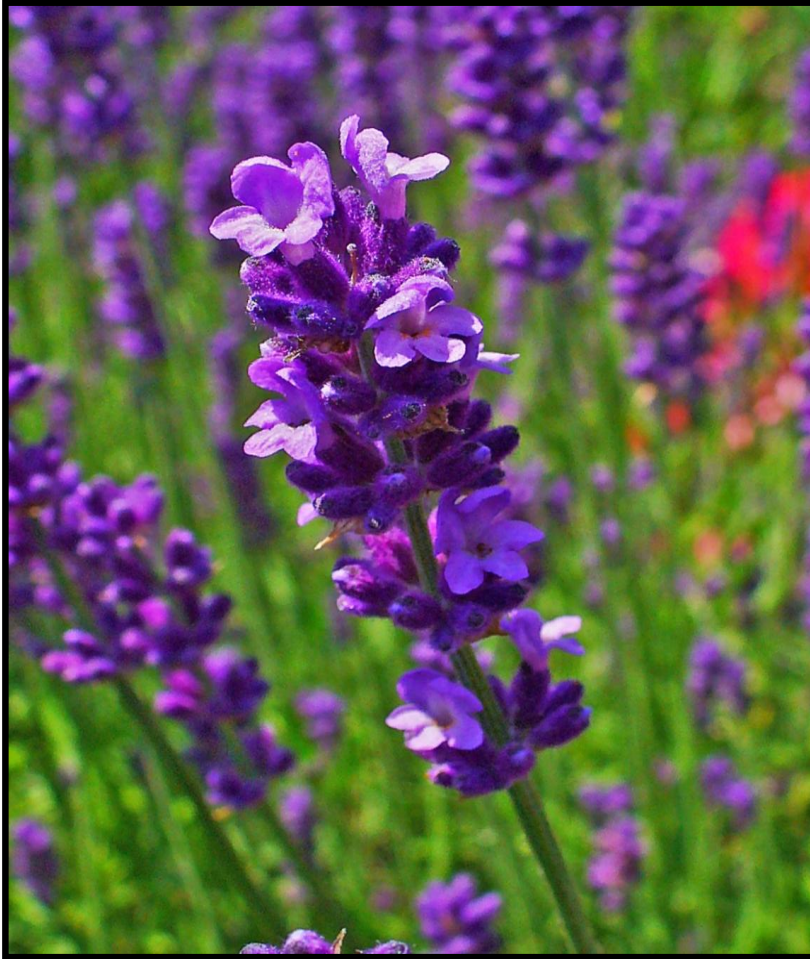
Fig. 1. Plant morphology_____ (Source: https://commons.wikimedia.org/wiki/File:Lavandula_angustifolia_002.JPG ) https://commons.wikimedia.org/wiki/File:Lavandula_angustifolia_002.JPG