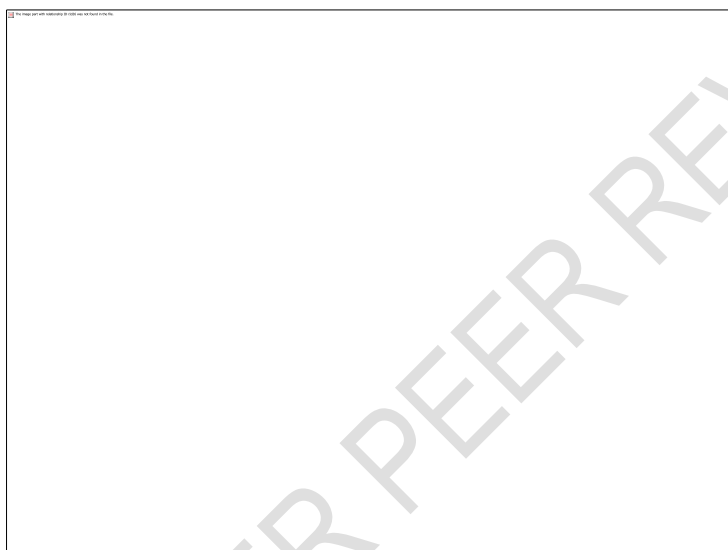
Figure 3: Bar graph represents the correlation between RBS and pH with the dental complaints. The X-axis represents the dental complaints , and the Y-axis represents the mean value of RBS and pH. The green color represents pH , and the blue color represents RBS. Samples with periodontic complaints have higher mean value of RBS values(193) than other dental complaints and the mean pH value is same for all dental complaints. Pearson's correlation test was done , and the association was found to be statistically significant with Pearson's correlation value of (r=1).

Figure 2: Bar graph represents the correlation between RBS and pH with age. The X-axis represents the age , and the Y-axis represents the mean value of RBS and pH. The green color represents pH , and the blue color represents RBS. It is analyzed that the mean RBS value is higher in the 41-50 years age group of people than in other age categories and the mean pH value is same for all age categories. Pearson's correlation test was done , and the association was found to be statistically significant with Pearson's correlation value of (r=1).