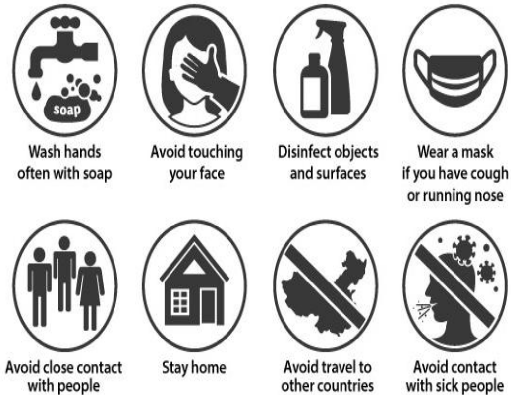
Fig 2: Ways of prevention from COVID-19 (Coronavirus)

The COVID-19 outbreak Nutrition advice for adults: (If N in nutrition is capital letter, then the highlighted letters should be capital too. I would have made firmer suggestions but I don't understand style of writing you are using)