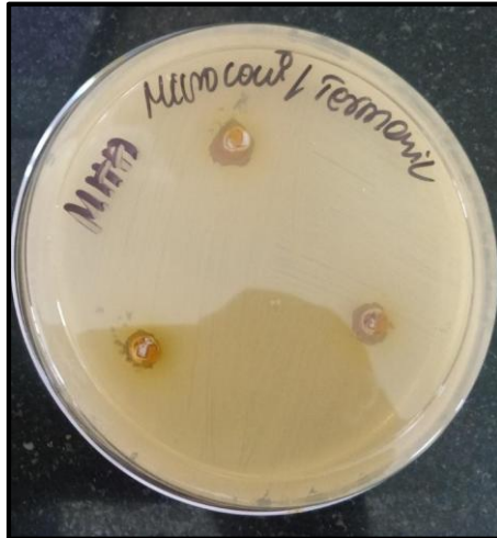
FIGURE 1: The image shows the zone of inhibition of turmeric against micrococcus