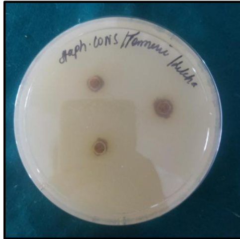
FIGURE 3: The image shows the zone of inhibition of turmeric against Coagulase-negative staphylococci