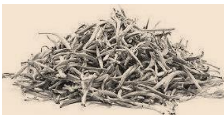
Figure 1 Captured Picture of crude White tea