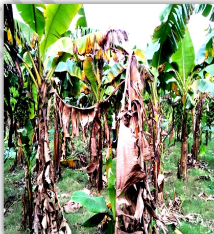
Plate-1. Panama wilt infected banana orchards at Dhamdaha village, in Purnia district of Bihar