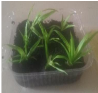
Fig 3: (a) Tissue Culture pineapple plantlets