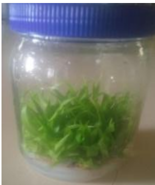
Fig 3: (a) Tissue Culture pineapple plantlets