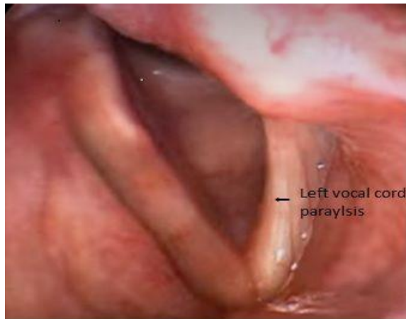
Figure 1: Unilateral vocal cord paralysis

Along with this, bilateral deep vein thrombosis was found on both the legs. This clinical picture was sufficient enough to order the appropriate investigations for the patient.