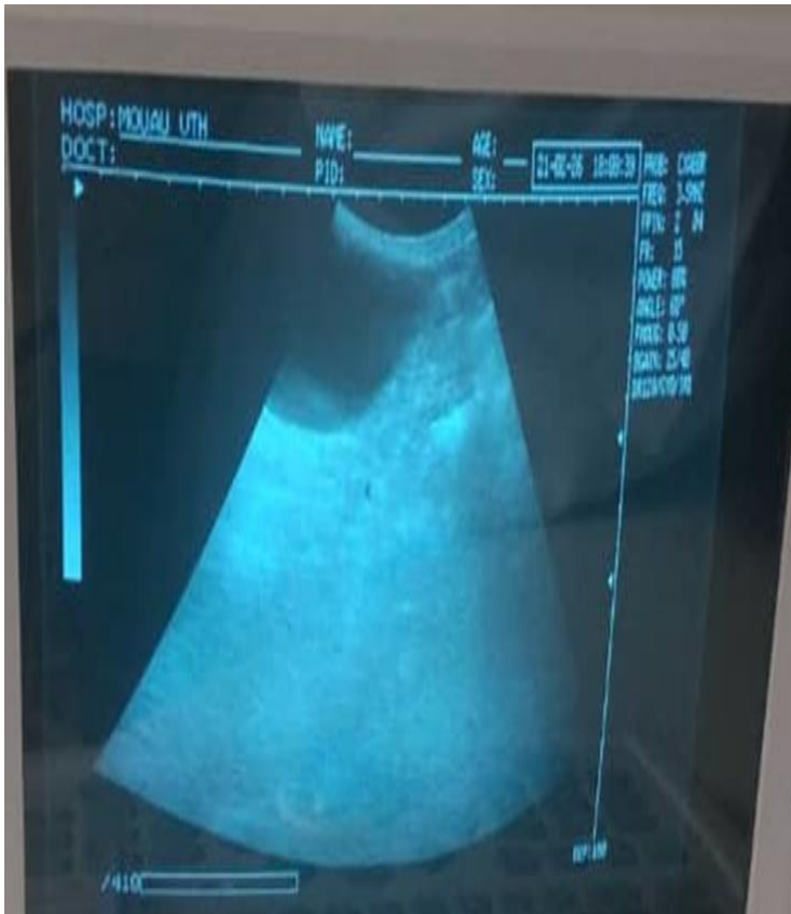
Figure 1: Showing ultrasonography of non-pregnant pseudopregnant uterus of the bitch