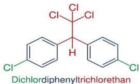
Fig. 1a, Chemical Structure of DDT; Courtesy of Rachel et al.,[55].