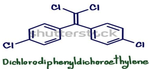
Fig. 1b, Chemical structure of DDE

According to IARC 2018, chronic exposure to DDT has been considered carcinogenic to animal liver arising during metabolism. Once the pesticides DDT has been ingested and transported in blood into the Liver, DDT is primarily converted into a less toxic component DDD, with smaller amount being dehydrochlorinated to DDE [65] DDD readily degrades through several intermediates to form DDA, which is readily released in urine, however DDE is poorly eliminated and therefore bioaccumulates in lipid-rich tissues hence toxicity arises [1] (Figure 2.).