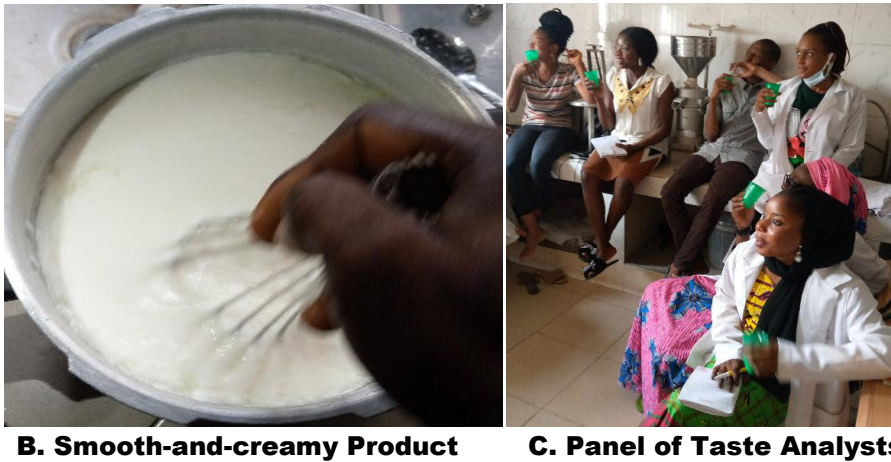
Fig.2: COMPARATIVE BACKSLOPPING ABILITY OF SOME LACTIC ACID BACTERIA STRAINS

Comment [f50]: You do not need to bold a labelled figure