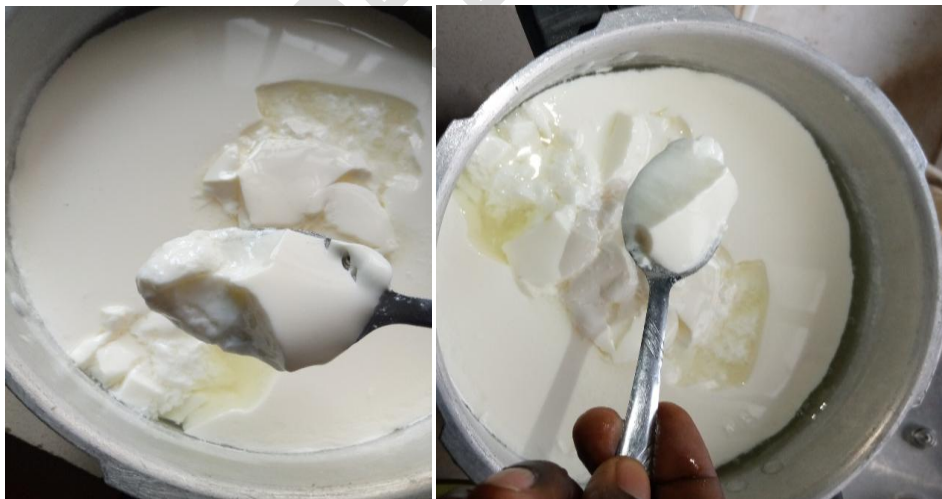
A. Soft, smooth, pudding-like, firm textured Product- Consistent Throughout Backsloping Batches

Figure 1 shows the mean percentage acceptance of the yoghurts produced by the various lactic acid bacteria cultures. The highest being WS65 (84%) while the lowest was ES32 (50%).