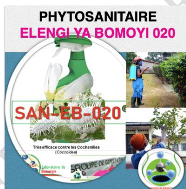
Figure 2. Phytosaneb-020

Plant derivatives can be used as an alternative approach to chemical pesticides [11-12].