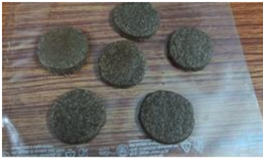
Fig.4 F3 Cookies