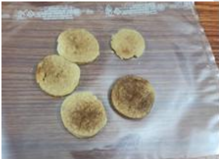
Fig.2 F1 Cookies

The procedure for preparation of cookies is followed as shown in flow sheet. The resulted products from four formulations of one control sample and 3 formulations of date seed powder incorporated cookies varied in physical, chemical and organoleptic properties. The prepared cookies are shown in Fig- 2, 3, 4 & 5 .