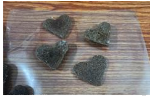
Fig.5 F4 Cookies