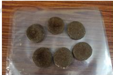
Fig.3 F2 Cookies